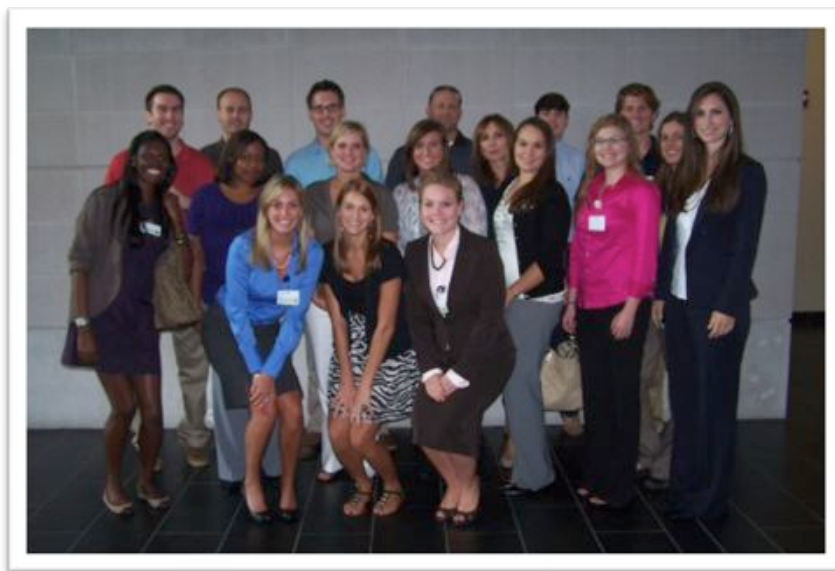
Members from the Class of 2013 attend a GANA Board Meeting held at the GHSU campus